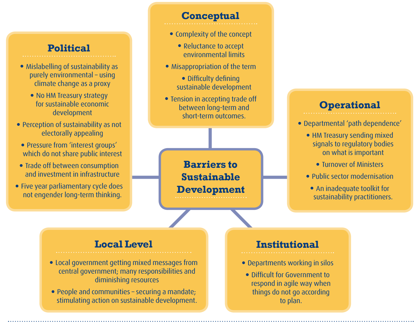
Figure 5 Barriers to Embedding Sustainable Development in Government

A clear vision and definition of sustainable development will overcome the conceptual barriers, especially when accompanied by capability building within Government and effective engagement with the wider the public to make it easy and desirable for people to live more sustainable lives.<sup>18</sup> Many of the institutional and operational barriers to sustainability would be minimised by strong governance arrangements and effective mechanisms for delivery, reporting and learning. It will be easier to engage local governance bodies and community groups on sustainable development if a clear vision and the benefits of sustainability are apparent in every policy, regulation and piece of guidance that relates to the local level. Governments need to take long-term decisions beyond their immediate electoral value.