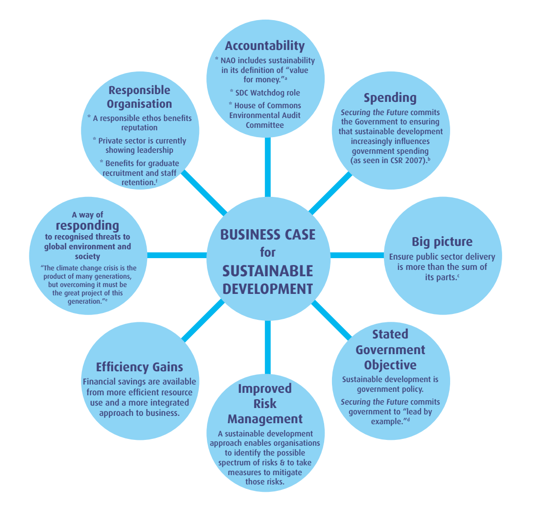
Figure 4 The Business Case for Sustainable Development

In preparing the business case, engaging the necessary stakeholders in its development from the earliest stages will help create buy-in and support. Bringing together the right people to set priorities and make key decisions will increase the probability of success. As sustainable development is a whole organisation approach, a lack of engagement across staff and associated departments or bodies risks failure through fragmentation. For further