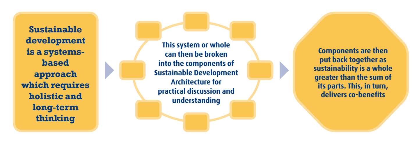
Figure 2 Understanding the Sustainable Development Approach

Getting the right high-level plans in place to leverage change is essential for sustainable development to be properly embedded in any organisation, but so too is a 'bottom up' approach to particular topics or cross-cutting issues. This guide offers advice on how to do both 'top down' and 'bottom up'. It describes how the principles of sustainable development can be embedded in the overall 'architecture' of Government; focuses on specific aspects of that architecture and the structures and processes around them – with practical guidance for practitioners; and, finally, provides an overview of how all these structures and activities can be integrated into a genuinely holistic approach. This is outlined in Figure 2.